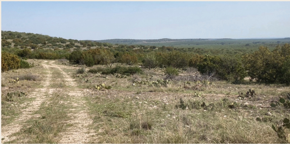
At Field Ranch, the view from the top of the hill offers a spectacular vista.