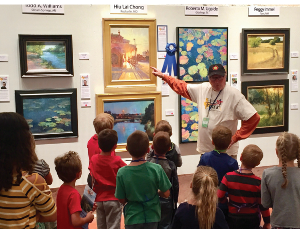
San Angelo children at the Museum of Fine Arts benefit from the artists' willingness to share their time.