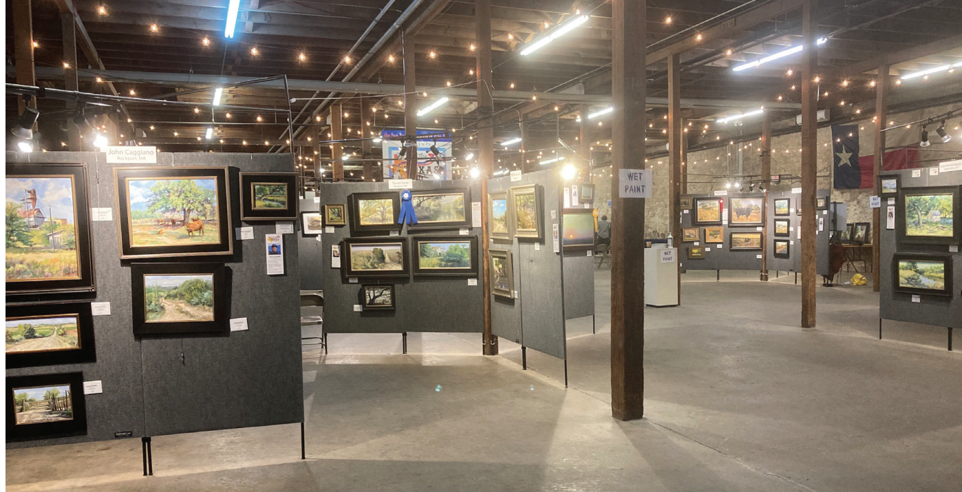
Stables Exhibit of art works at Fort Concho.

ism, San Angelo also boasts a thriving art and music culture. Often named a Top Ten City, San Angelo is proud of its western and military influences, educational facilities plus recognized health care and retirement amenities.