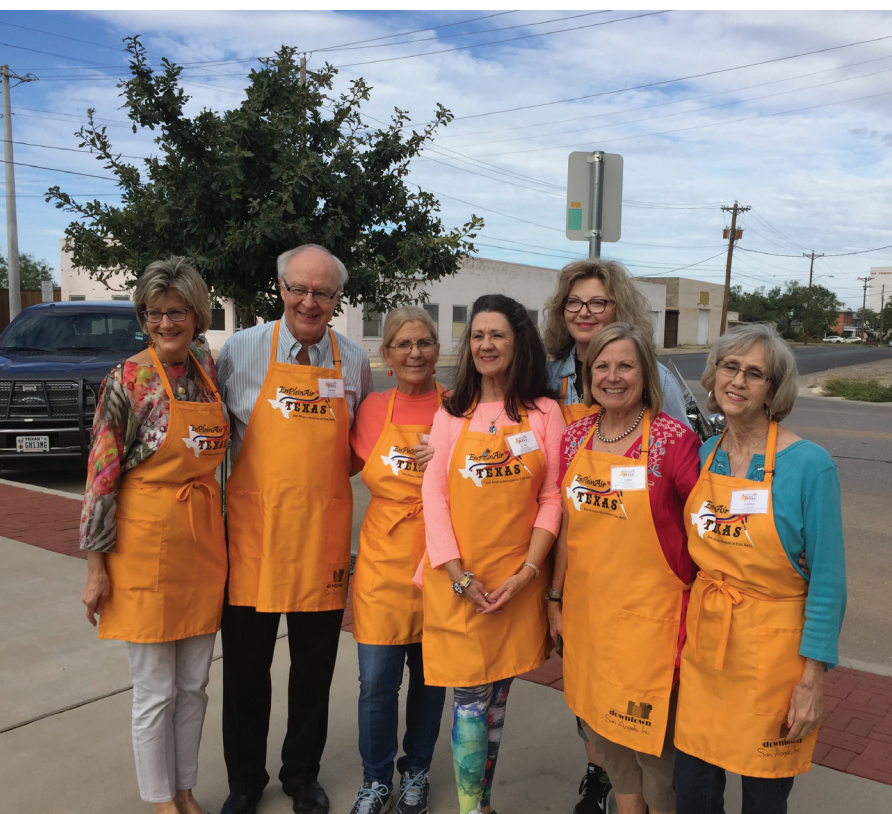
Some happy volunteers pose for a photo during a past EnPleinAir TEXAS event.

This year's 35 participating artists are coming to San Angelo from as far away